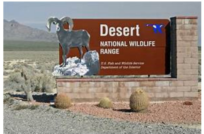
Desert National Wildlife Refuge sign

Encompassing six major mountain ranges and seven distinct life zones, Desert NWR showcases the abundance and variety of nature that can be found in Southern Nevada, all just a short drive from Las Vegas.